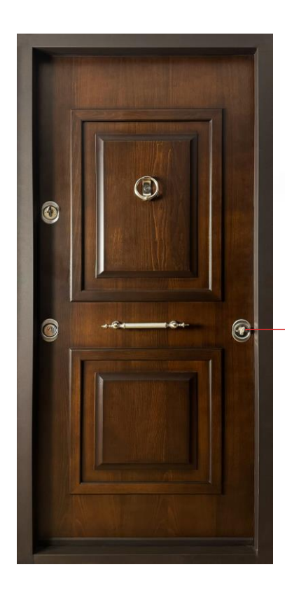
PLATE SQUARE 28 mm